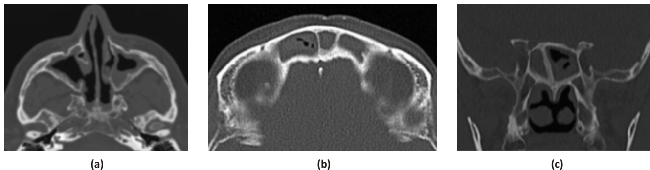
Figure 1. CT images of osteitis (a) maxillary, (b) sphenoid, and (c) frontal sinus. 3

The improvement CRS after surgery can be influenced by the degree of osteitis and systemic factors. Therefore, this study is to analyze the correlation between preoperative osteitis degree with the postoperative endoscopic scores in chronic rhinosinusitis.